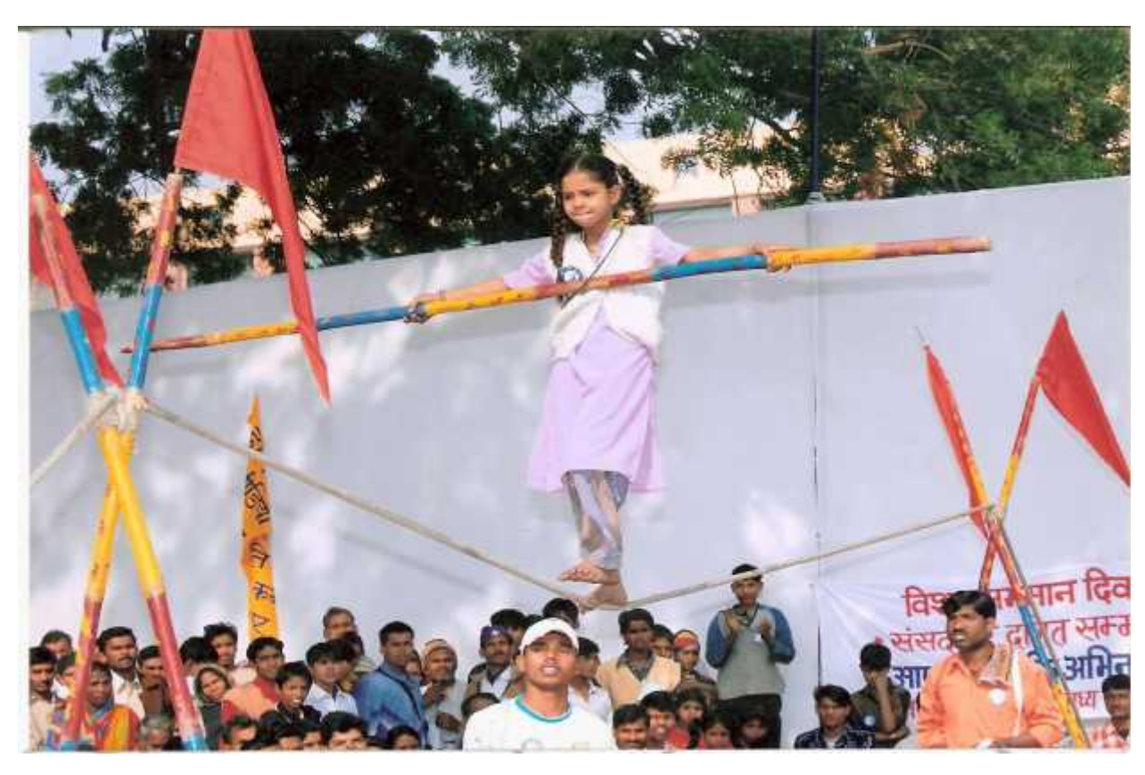
A Nat Girl Performing