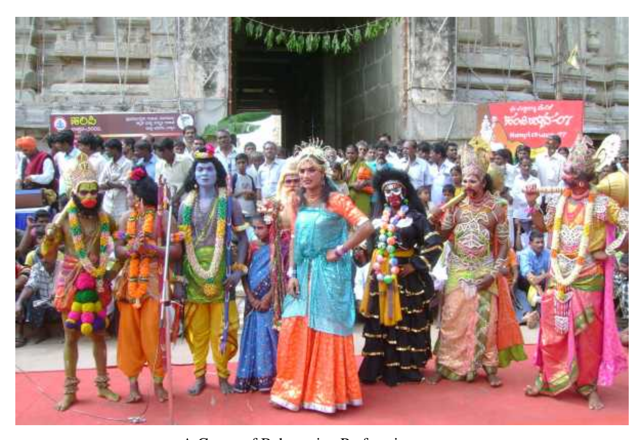
A Group of Baharupiya Performing