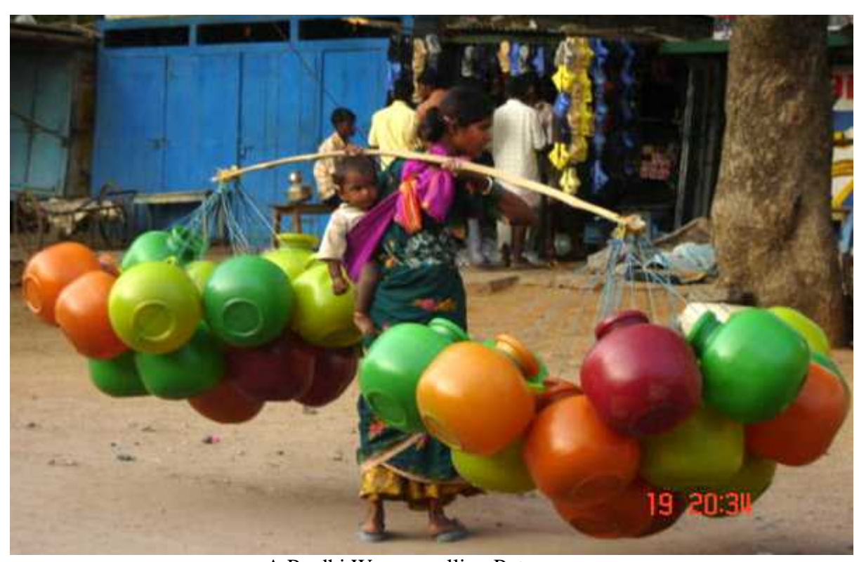
A Pardhi Woman selling Pots