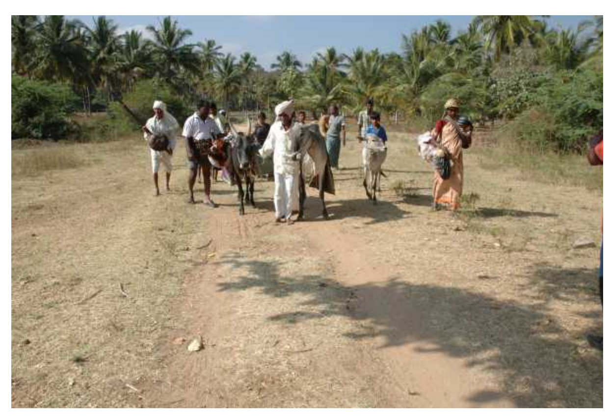
Nandiwalla on Move