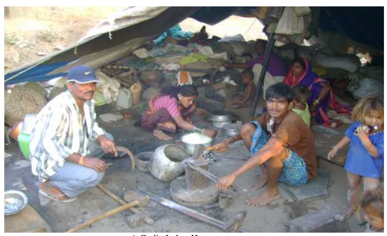
A Gadia Lohar Home