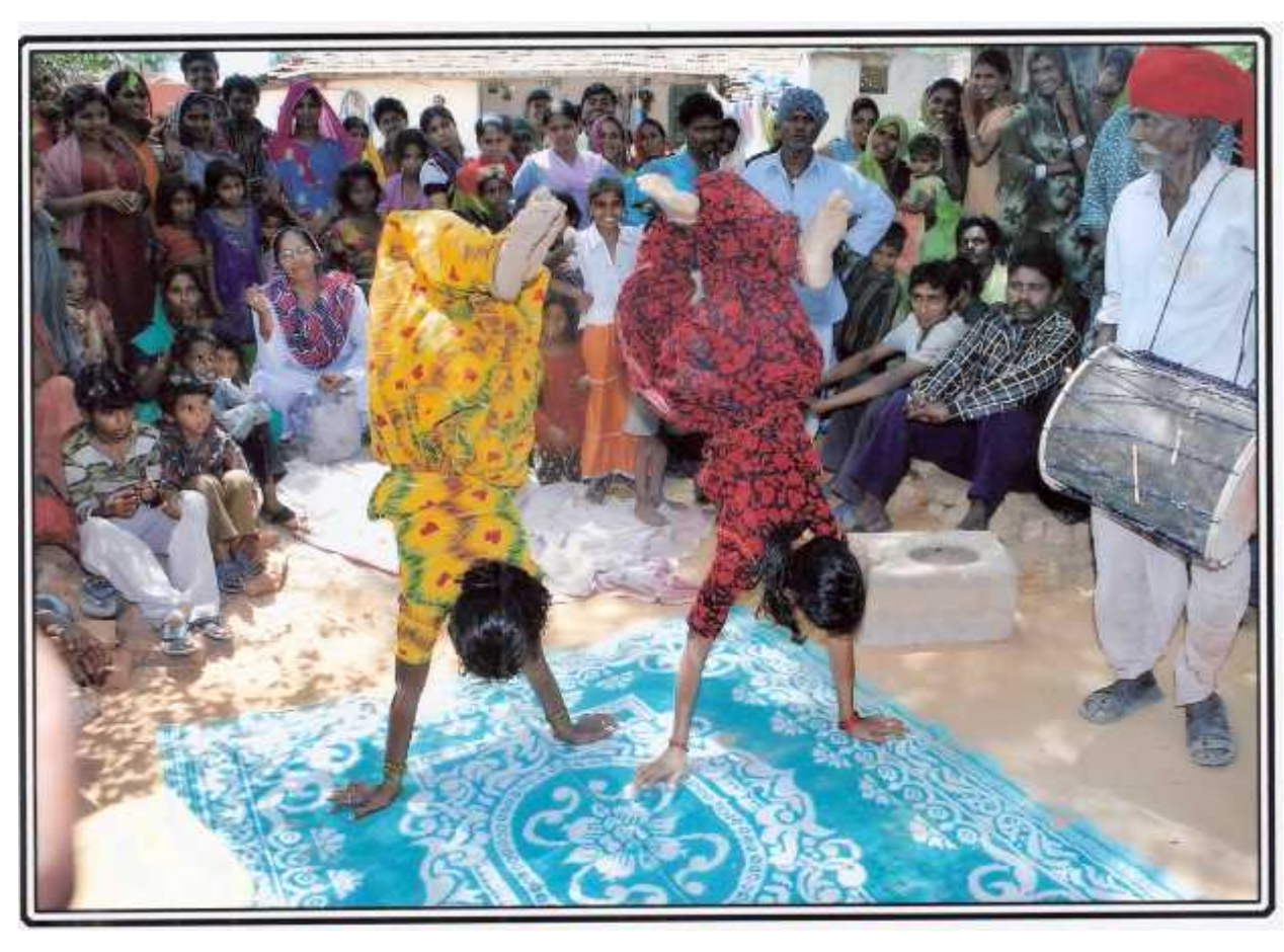
Nat Girls Performing